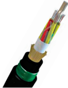
MLT Corrugated Steel Tape