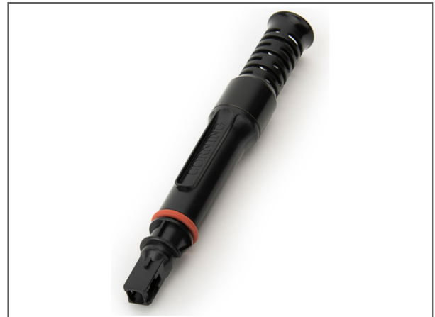
BPEO Fiber Closure EVOLV PUSHLOK BPEO S0 04P 04F