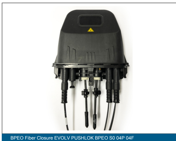
BPEO Fiber Closure EVOLV PUSHLOK BPEO S0 04P 04F

Reliable and watertight with an integrated valve for flash on-site testing