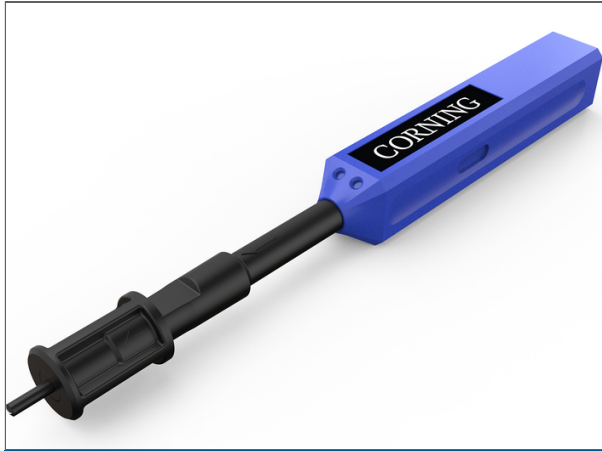
Single Fiber port cleaner for Pushlok and Optitap connectors and multi-ports