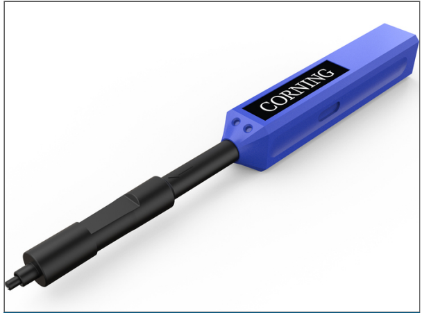
Single Fiber port cleaner for Pushlok and Optitap connectors and multi-ports